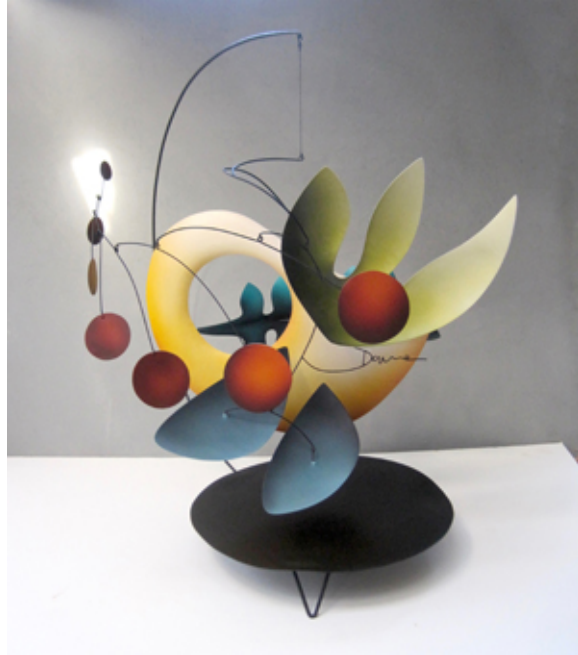
Summer Storm Steel and aluminum with nylon cord, oil and acrylic paint 29 x 28 x 28 inches